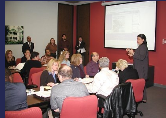
Bexar County SMWBE Outreach Seminar

Bexar County is committed to increasing the involvement of SMWBEs in the procurement process. It is the intent of the County to afford SMWBE a fair opportunity to compete for all Bexar County contracts. Similarly, the County promotes SMWBE participation in its Tax Phase-in Program to support the growth and diversity of a regional economy.